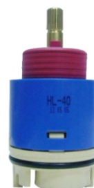
15-006 CERAMIC DISC PRESSURE BALANCED VALVE