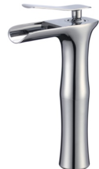
1155 CHROME CERAMIC DISC