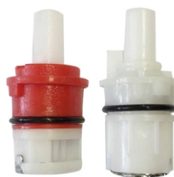
23-002 WASHERLESS CARTRIDGE