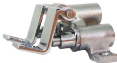
2982 Chrome Double Foot Operated Valve Push-Button Cartridge-Color Coded Foot Pedals, 5-1/2" Bracket, 4-1/2" Screw Hole