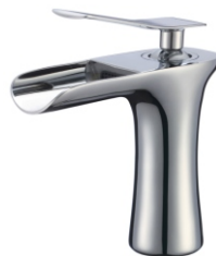
1153 CHROME CERAMIC DISC