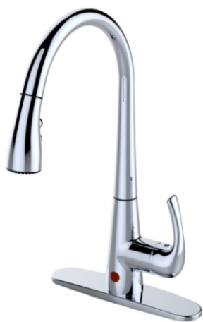
1170 CHROME SENSOR CERAMIC DISC