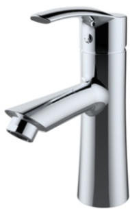
1156 CHROME CERAMIC DISC