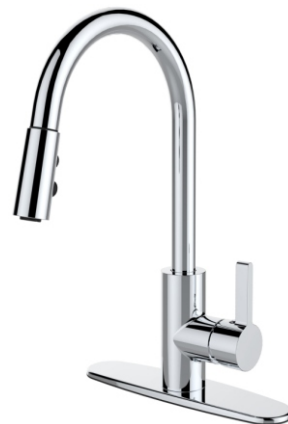
1174 CHROME CERAMIC DISC