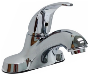
1003 CHROME BALL