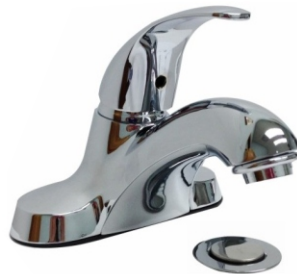
1004 CHROME BALL