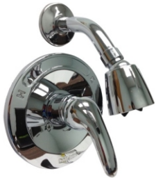
1408 CHROME BALL