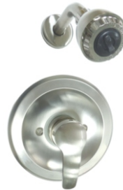
1438 BRUSHED NICKEL BALL