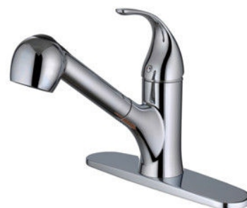
1601 CHROME CERAMIC DISC