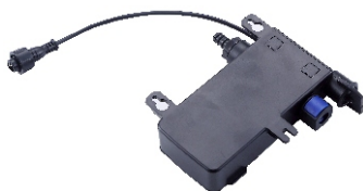
17-020 SENSOR CONTROL BOX FOR KITCHEN FAUCET