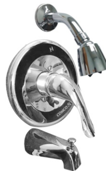
1507 CHROME CERAMIC DISC