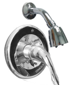
1508 CHROME CERAMIC DISC