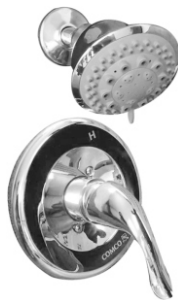
1502 CHROME CERAMIC DISC