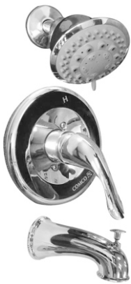
1501 CHROME CERAMIC DISC