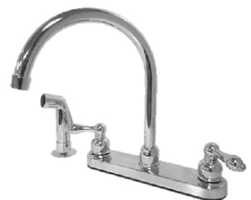
2635 CHROME WITH SPRAY