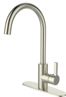
1191 BRUSHED NICKEL CERAMIC DISC