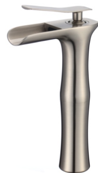
1145 BRUSHED NICKEL CERAMIC DISC