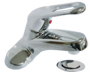
1111 CHROME BALL