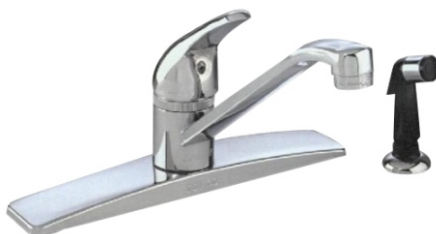
1137 BRUSHED NICKEL BALL WITH SPRAY