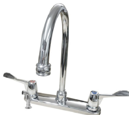
2638 CHROME WITH SPRAY