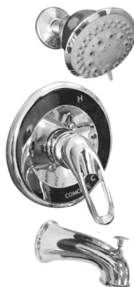
1511 CHROME CERAMIC DISC