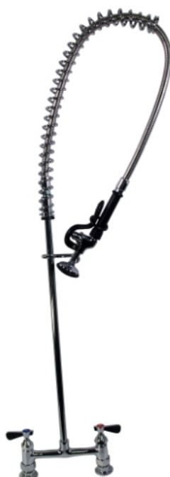
2872 Chrome Two Handle 8" Deck Mount Pre-Rinse Faucet Compression-8" Centers, Lever Handles, 24" Rise, 36" Hose w/ Spring