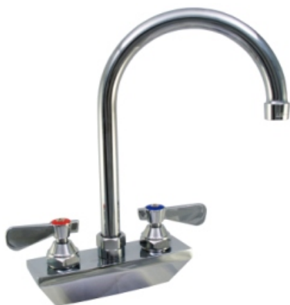
2894 Chrome Two Handle 4" Wall Mount Faucet 6"、8" Spout