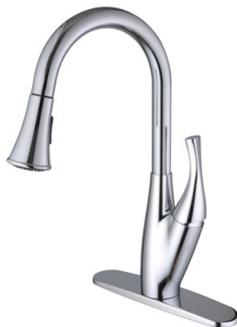
1173 CHROME CERAMIC DISC