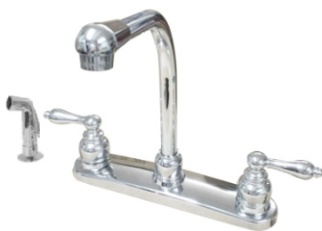
2615 CHROME WITH SPRAY