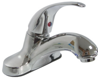
1033 BRUSHED NICKEL BALL