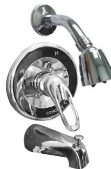
1517 CHROME CERAMIC DISC