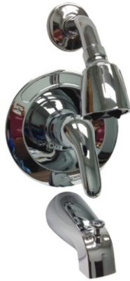
1407 CHROME BALL