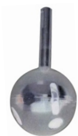
07-006 STAINLESS STEEL BALL