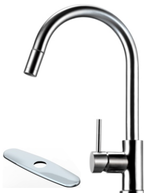
1374 STAINLESS STEEL CERAMIC DISC