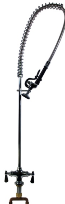
2873 Chrome Two Handle Double Pantry Deck Mount Pre-Rinse Faucet Compression-Lever Handles, 36" Hose w/ Spring