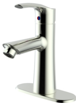
1146 BRUSHED NICKEL CERAMIC DISC