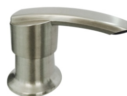
07-031 BRUSHED NICKEL Soap Dispenser