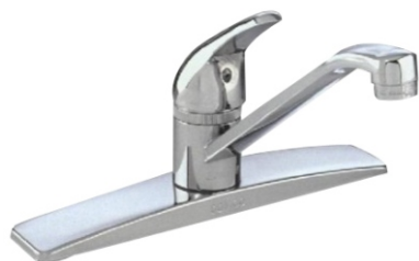
1136 BRUSHED NICKEL BALL