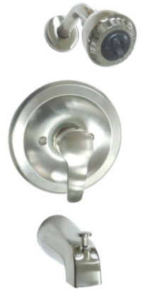
1437 BRUSHED NICKEL BALL