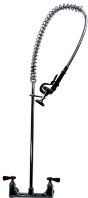
2871 Chrome Two Handle 8" Wall Mount Heavy Duty Pre-Rinse Faucet Compression-8" Spread, Lever Handles, 24" Riser, 36" Hose w/ Spring, Heavy Duty Body