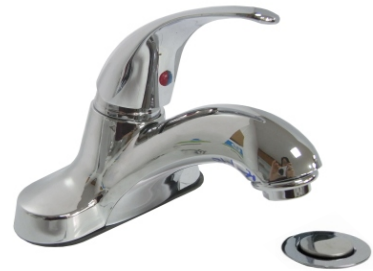
1034 BRUSHED NICKEL BALL