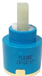
17-006 CERAMIC DISC