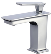
1151 CHROME CERAMIC DISC