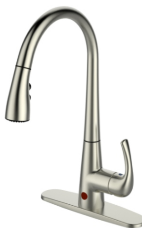
1180 BRUSHED NICKEL SENSOR CERAMIC DISC