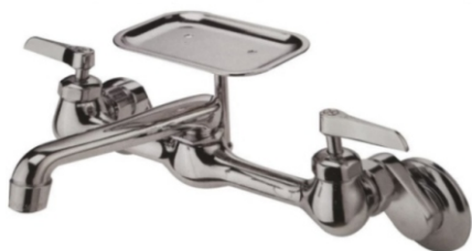
2861 Chrome Two Handle, 8", 10", 12", 14" Wall Mount Faucet Compression-8" Centers, Lever Handles, 10" Spout, Heavy Duty Body