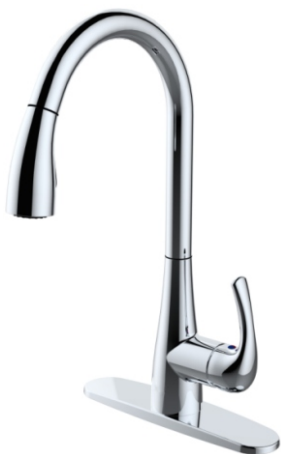
1172 CHROME CERAMIC DISC