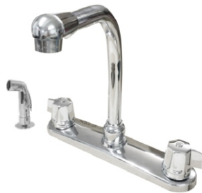
2611 CHROME WITH SPRAY