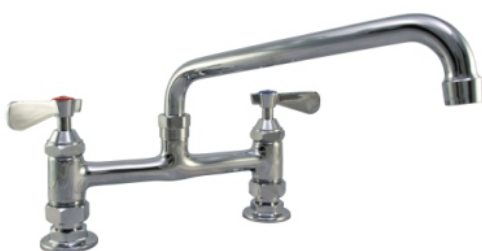
2863 Chrome Two Handle 8" Deck Faucet Compression, 8", 10", 12", 14" Spout