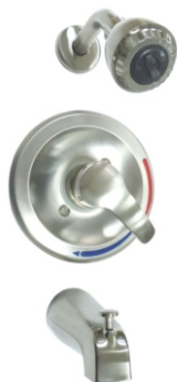
1531 BRUSHED NICKEL CERAMIC DISC