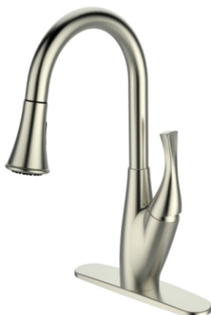
1183 BRUSHED NICKEL CERAMIC DISC