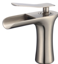
1143 BRUSHED NICKEL CERAMIC DISC