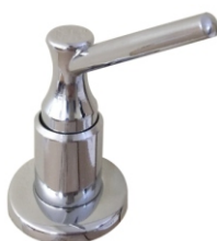
07-030 CHROME Soap Dispenser