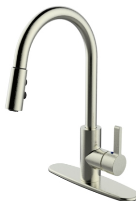
1184 BRUSHED NICKEL CERAMIC DISC