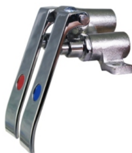
2981 Chrome Double Lever Knee Operated Valve Self Closing Push-Button Cartridge-Color Coded Pedals, 4-1/8" Bracket, 4-1/2" Screw Hole