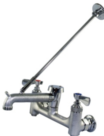
2865 Chrome Two Handle 8" Wall Mount Service Sink Faucet Compression-Lever Handles, Mop/Slop Sink Application