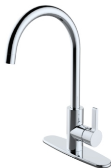
1161 CHROME CERAMIC DISC