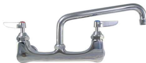
2862-8 Chrome Two Handle, 8", 10", 12", 14" Wall Mount Faucet Compression-8" Centers, Color Coded Lever Handles, 10" Spout