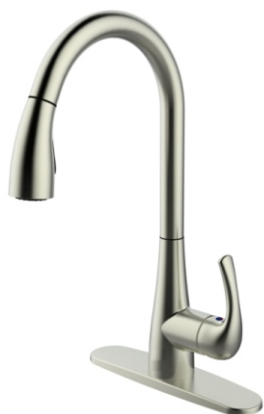
1182 BRUSHED NICKEL CERAMIC DISC