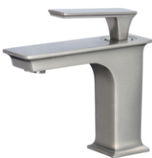
1141 BRUSHED NICKEL CERAMIC DISC