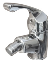
191 CHROME BALL