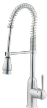
1171 CHROME CERAMIC DISC